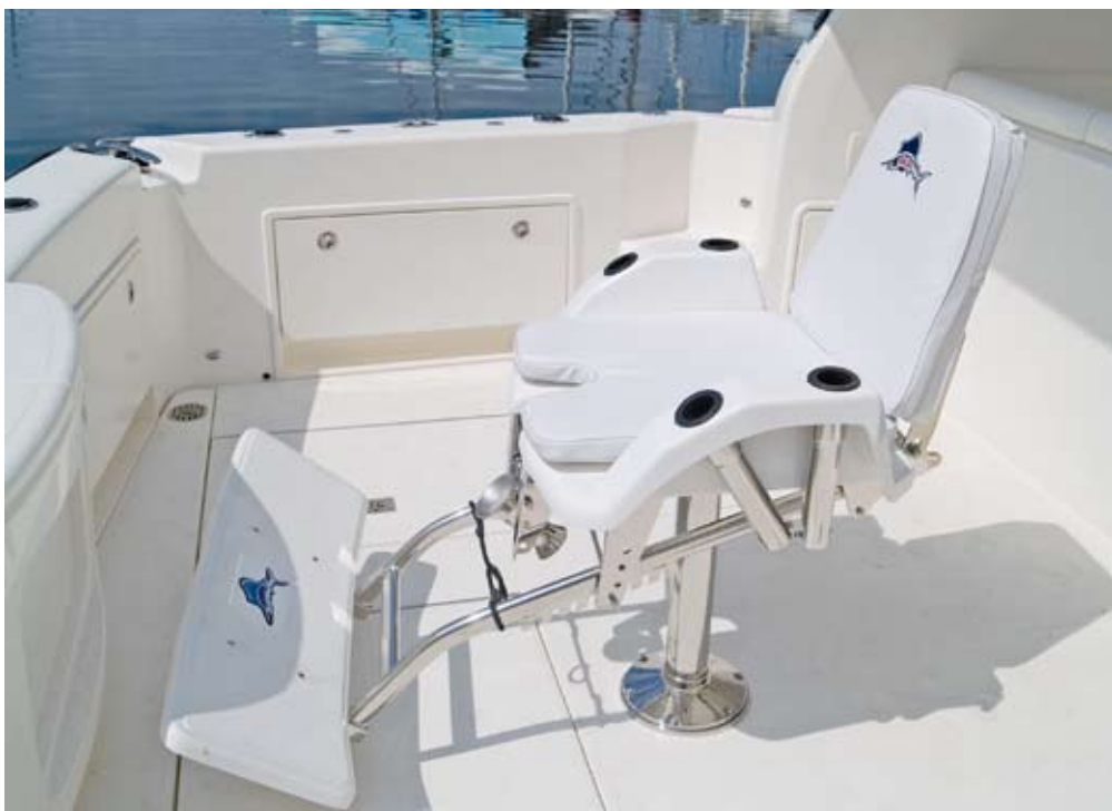
Comfortable fighting chair with removeable cushions, rod holders and foot rest – to haul in “the big one”

The cabins sleep six and the master cabin features a queen-sized bed. ➤