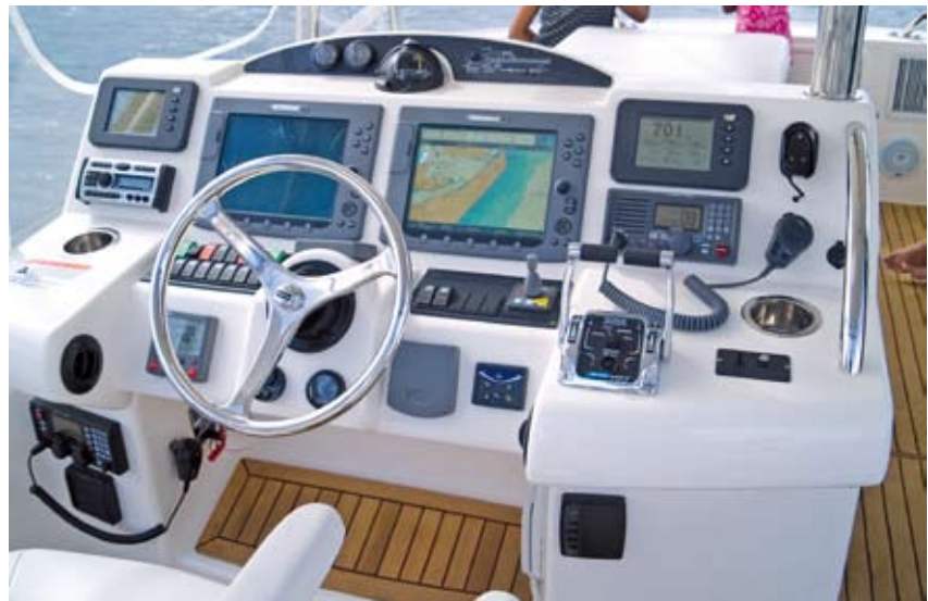
State-of-the-art electronics, including controls and autopilot, in the high helm station.

No single feature makes the 45 such a remarkable boat, it's a combination of many, but I'll cover as many as space will allow. On the deck, an anchor locker with a rope and chain divider houses a 27 kg anchor which is accessed from around the walkway sides or from hatches on deck. An anchor winch easily operated by up-and-down foot switches is powered from the helm. There is a wash-down tap next to the anchor locker.