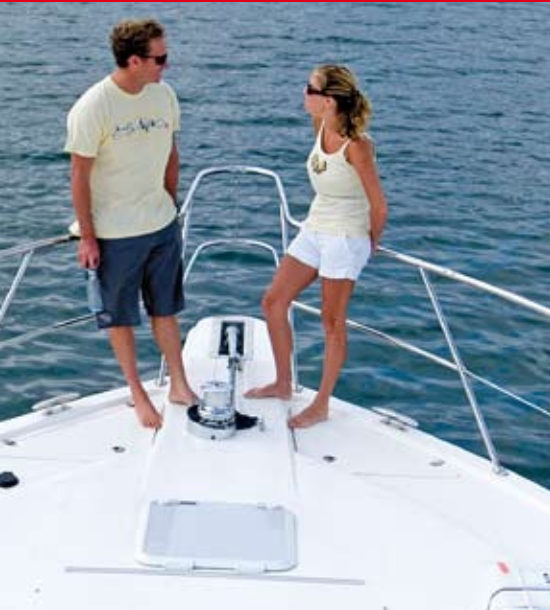
Extended bowsprit with anchor, chain and electric winch. A good spot for privacy.