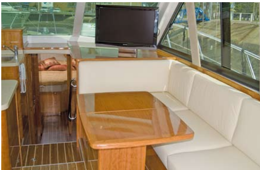
Entertainers' delight in the spacious cherry wood-finished saloon featuring 32" LCD screen and fold-out table.

To top it all you can relax on the L-shaped couch and watch a movie on the 32" LCD screen or pop your iPod into the compatible five-speaker sound system. What a blast! Or maybe you'd prefer a game of cards at the table which folds into different sizes.